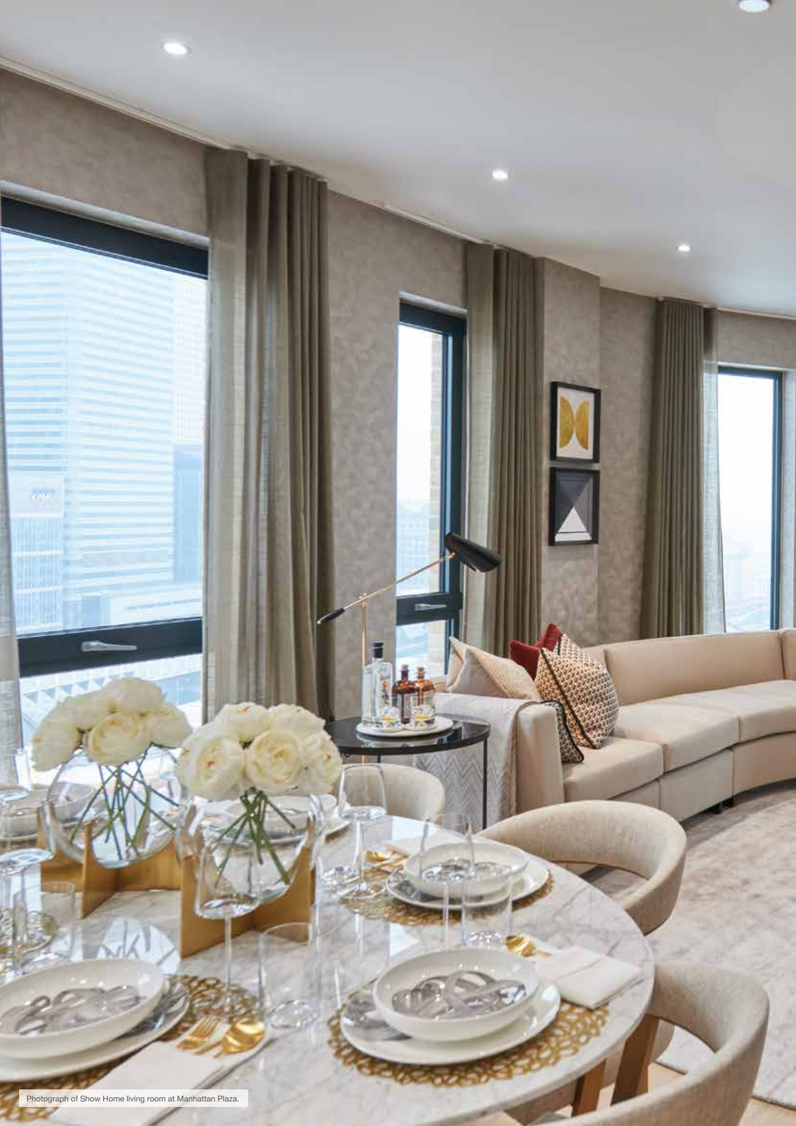
Photograph of Show Home living room at Manhattan Plaza.