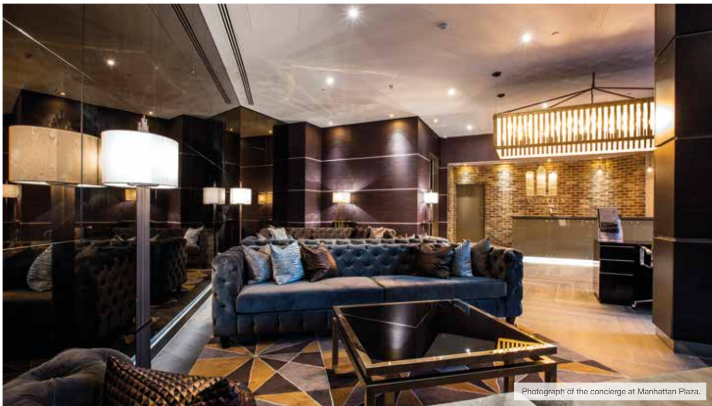
Photograph of the concierge at Manhattan Plaza.

A superior collection of two bedroom penthouses overlooking Canary Wharf. Designed to the last exquisite detail, with a premium specification, refined design and high style - Manhattan Plaza is an exceptional place to live.