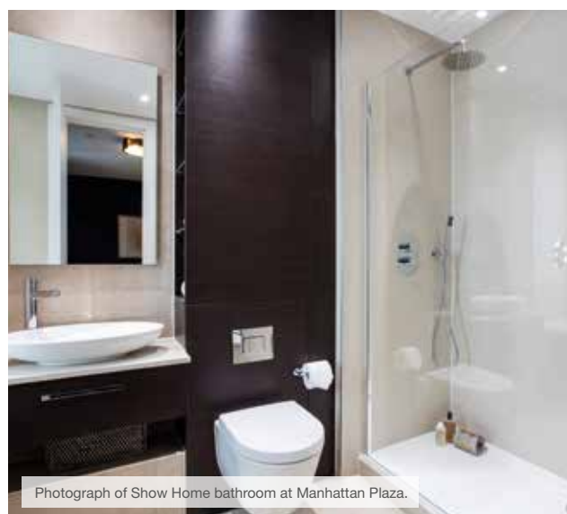
Photograph of Show Home bathroom at Manhattan Plaza.