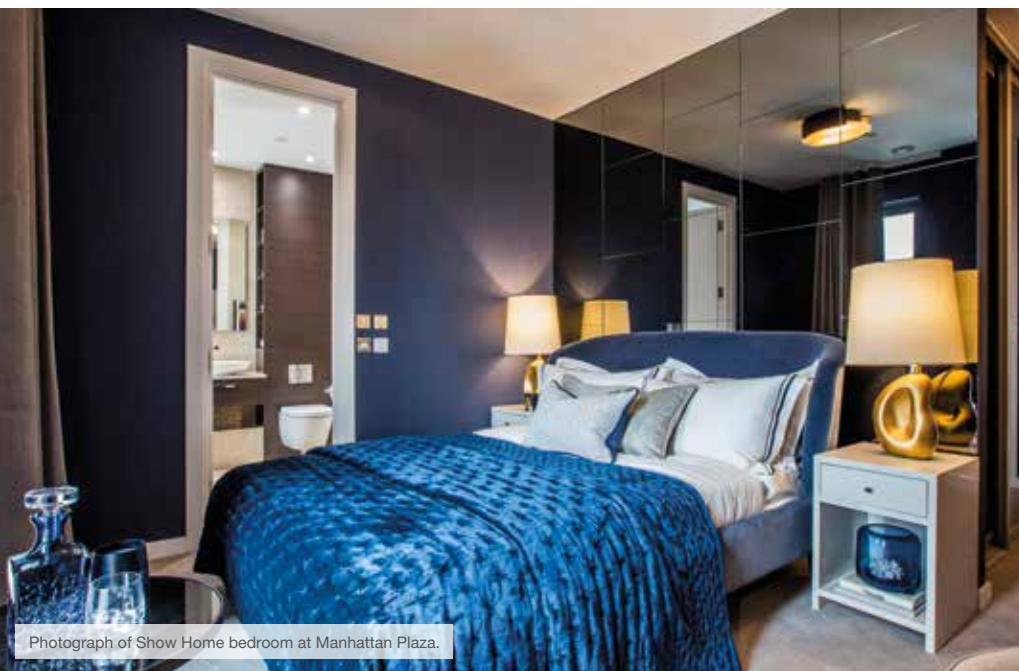
Photograph of Show Home bedroom at Manhattan Plaza.