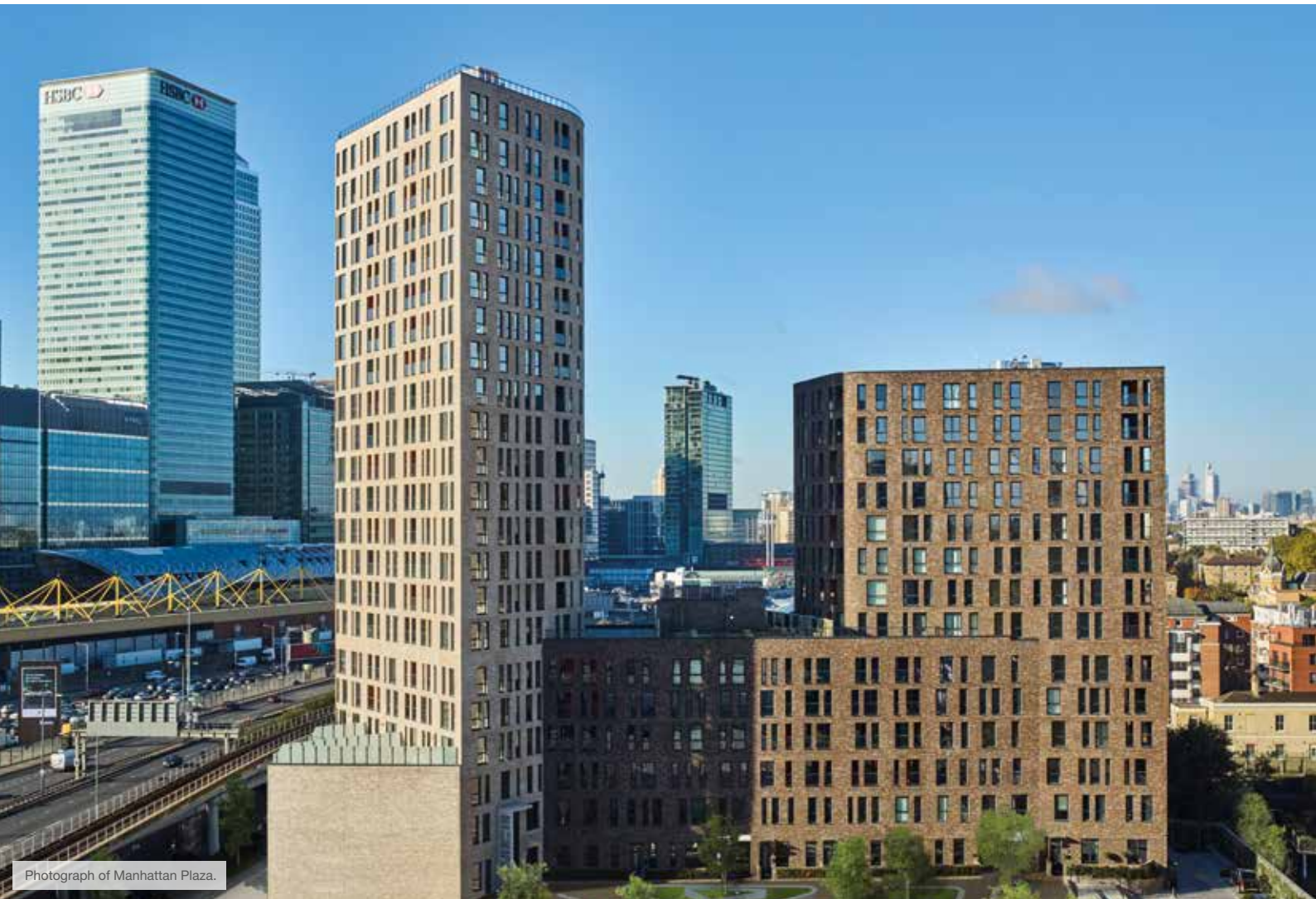
Photograph of Manhattan Plaza.

MANHATTAN PLAZA BENEFITS FROM ITS IMMEDIATE PROXIMITY TO CANARY WHARF, NOT ONLY BECAUSE OF THE BREATHTAKING VIEWS FROM THE ROOF TOP TERRACES, BUT ALSO BECAUSE OF THE BUZZING SOCIAL SCENE, ITS REPUTATION AS A WORLD-CLASS FINANCIAL AND TECHNOLOGICAL HUB AND AN EXCELLENT ARRAY OF SHOPPING FACILITIES.