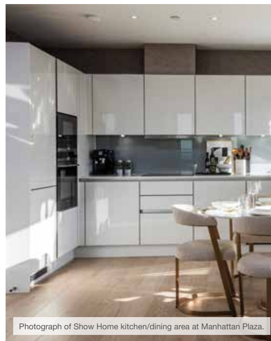
Photograph of Show Home kitchen/dining area at Manhattan Plaza.