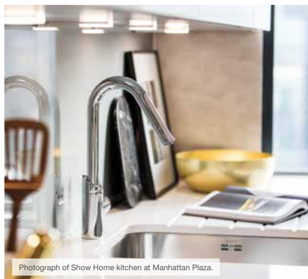
Photograph of Show Home kitchen at Manhattan Plaza.